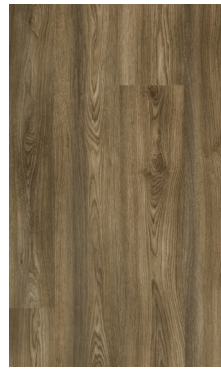
COLUMBIAN OAK 663D MOCHA 60000198