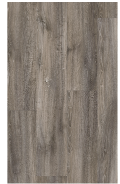
LIME OAK 996D ASH 60000124