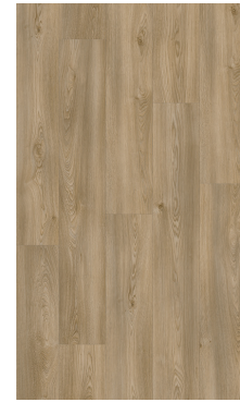
COLUMBIAN OAK 611M FAWN 60001620