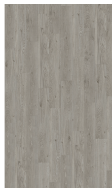
AUTHENTIC OAK 919M OYSTER 60001625