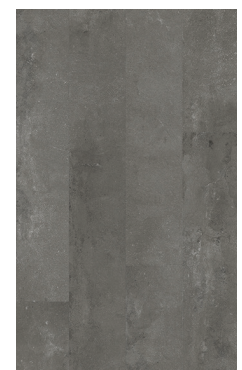
URBAN 996D GUNMETAL 60001628