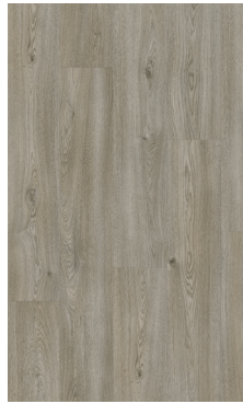
COLUMBIAN OAK 966M MIST 60001623