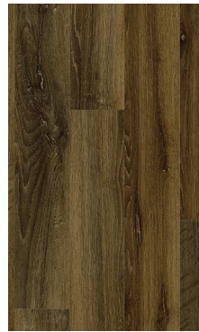
LIME OAK 954D COFFEE 60000200