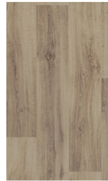
LIME OAK 669M SADDLE 60000121