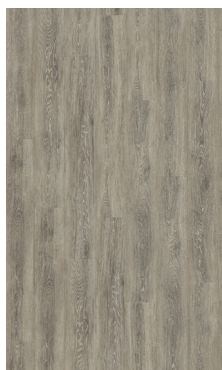
TOULON OAK 976M MINK 60000112