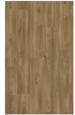
COLUMBIAN OAK 661M LATTE 60001622