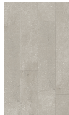
URBAN 166S LIMESTONE 60001627