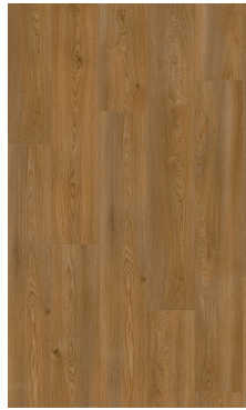
COLUMBIAN OAK 226M RUSSET 60000197