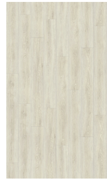
TOULON OAK 109S PEARL 60000108