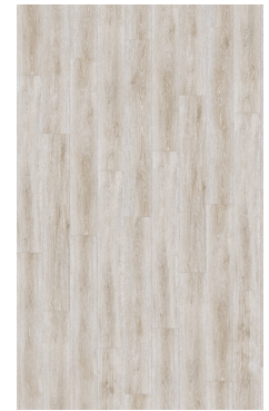
TOULON OAK 069L FLAXEN 60001624